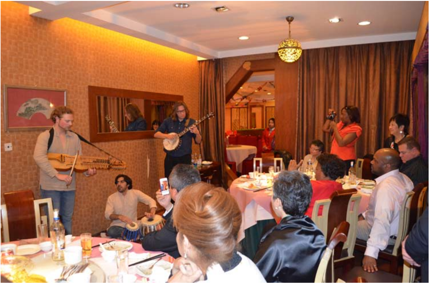
Banquet hosted by Shanghai Jiao Tong University for the UCLA Confucius Institute's delegation of California school principals