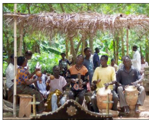
Plate 1: The Drummers at Penteng

At around ten in the morning on a healing day, the okomfo, shrine officials, shrine musicians, and some of the elders of the village gather at the shrine compound in preparation for the ceremony. The okomfo, shrine officials, and elders sit on wooden chairs and stools in the shade of a tree, while the musicians, usually about five male drummers and about seven female singers and rattle shakers, take their seats on wooden benches under a small structure built for shade (Plate 1). There, the