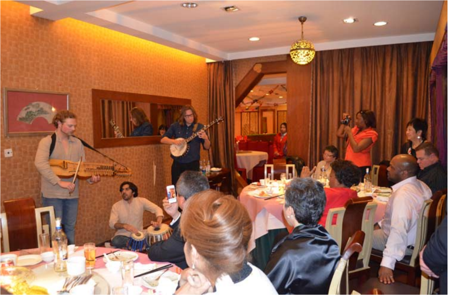
Banquet hosted by Shanghai Jiao Tong University for the UCLA Confucius Institute's delegation of California school principals