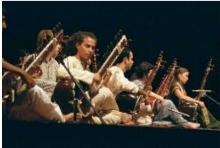
Students of the Music of India ensemble perform for the Spring Concert series.

The Ethnomusicology Graduate Student Organization (EGSO) held their third annual conference, "The Music Industry." The conference included presentations by UCLA ethnomusicology students, as well