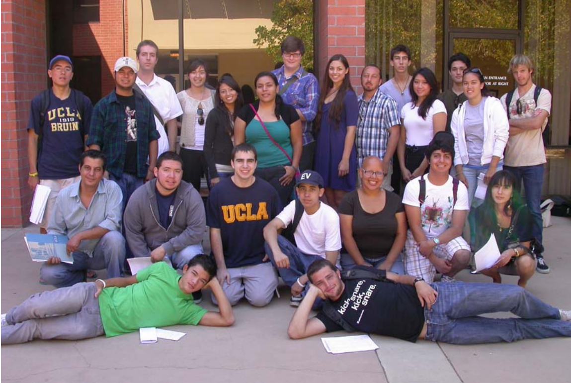
New undergraduate students, freshman and transfer, jazz studies and world music concentrations, Fall 2008